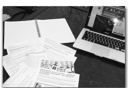
"So my notebook stayed blank"

• What are some steps that individuals can take to improve these problems?